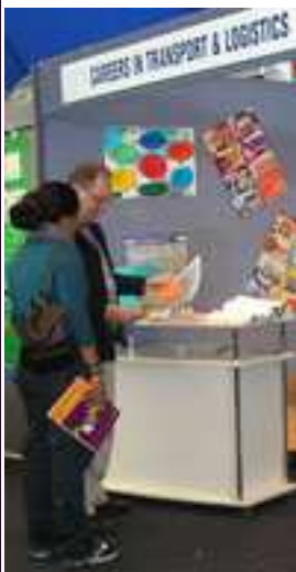
Visitors at the Expo